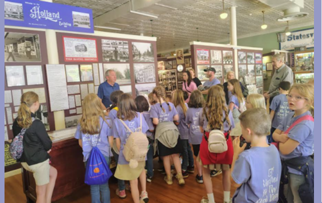
3rd Grade Field Tripexploring Downtown Statesville